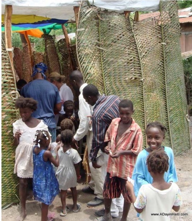
2- Kay Espwa " Hope House" Children's Home